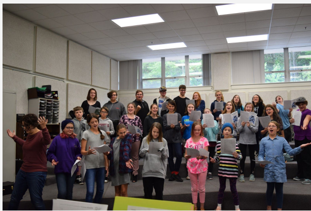
The combined chorus show us their character during a rehearsal.

2018 has been off to a fantastic start with the implementation of a couple of new programs! For the first time we have a full combined middle and high school chorus at WLC! This chorus is comprised of around 40 students and is a sound powerhouse. The students have been working hard to adapt to the new group environment and in no time at all have created a group sound that is absolutely incredible. In addition to the full chorus, we have our first large middle school band with more than 20 students. Growing from a 5th grade music level to an advanced middle school level has been a challenge, but the group has really come together and surpassed our expectations. Finally, as well as these new groups we have created an advanced middle school band with five students meeting once a week to practice new instruments and more challenging repertoire. With the implementation of these new groups and the growing number of students interested in participating in the various musical groups here at WLC, I have never been more excited for a school year and future school years! Don't forget our first concert will be held on Wednesday, December 19 at 6:30pm in the cafe. We hope you can make it; it will be a night to remember!